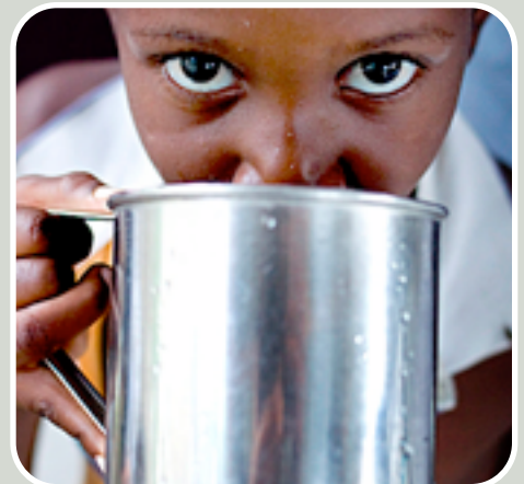
Child Receiving Clean Water at a IDP (Internally Displaced Person) Camp in Port-au-Prince

So far all of the schools in our city have been closed since the earthquake, except for us. We have closed for about 7 school days since the earthquake, which has been good to allow people to grieve, but it has also been for us to launch our own relief effort. Certainly none of us here at Sonlight are trained in how to run a successful relief campaign, and so it has taken each and every one of us here to make it work. This is why it has been timely that we have also been off school to give us the time to make it work. (continue on next page)