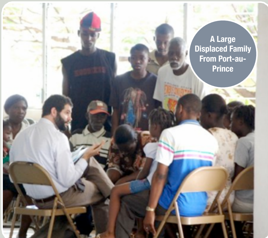
A Large Displaced Family From Port-au-Prince

Bottom - Some of our High School pouring rice and beans to make our relief kits